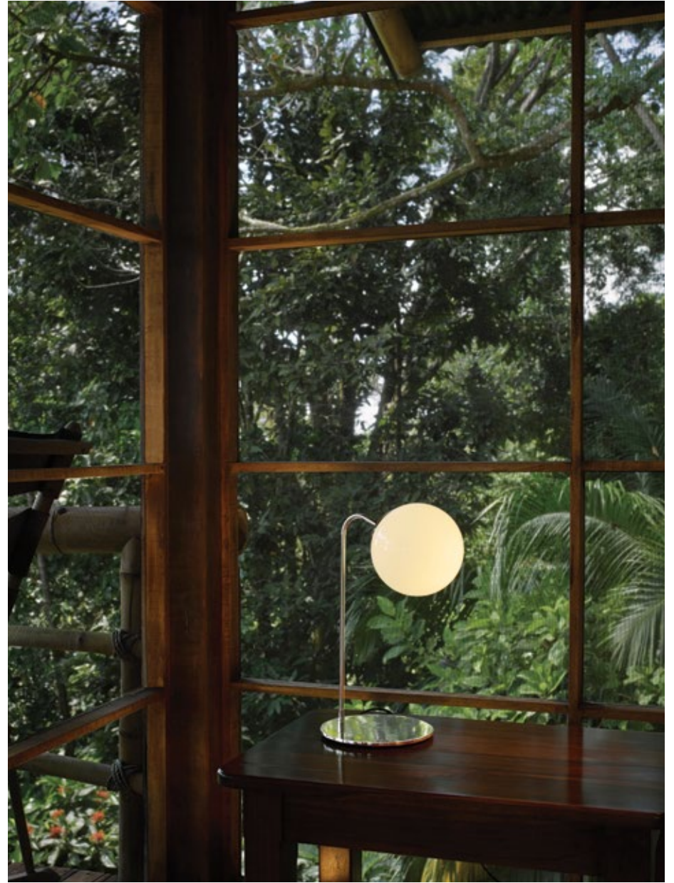
MODO Desk Lamp Polished Nickel / Cream