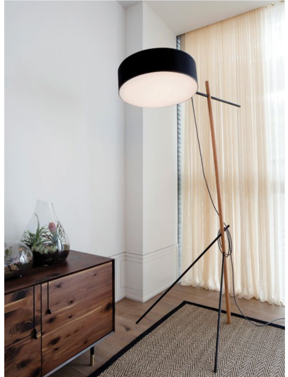
EXCEL Floor Lamp Black / Oak