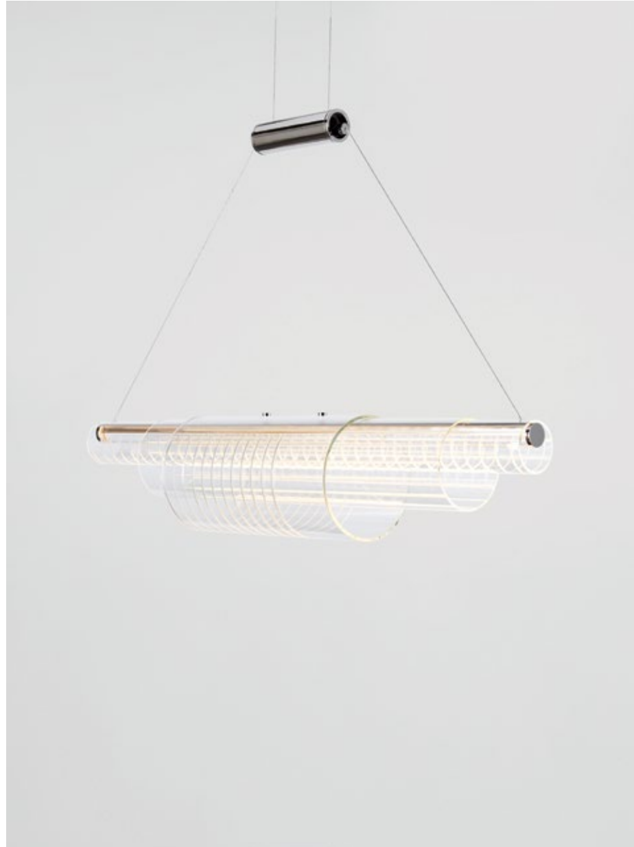
COAX Pendant – 2C Polished Nickel