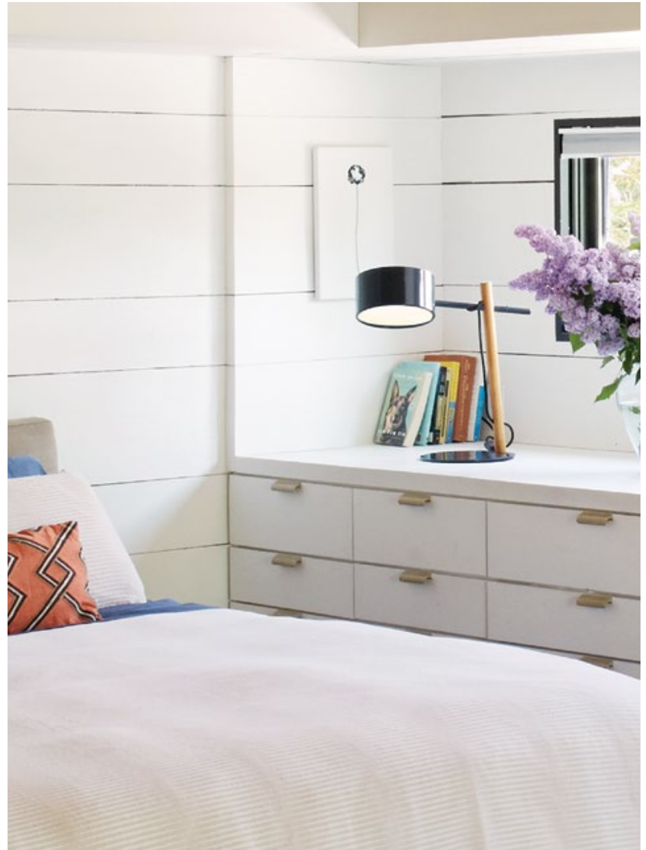
EXCEL Table Lamp Black / Oak