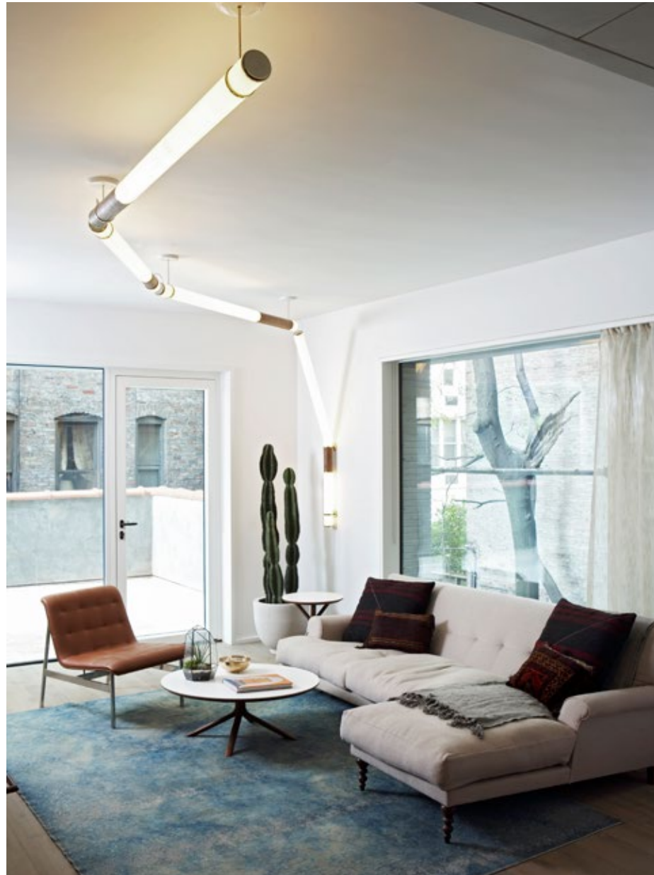
MINI ENDLESS Custom Configuration Polished Brass / Stained Oak