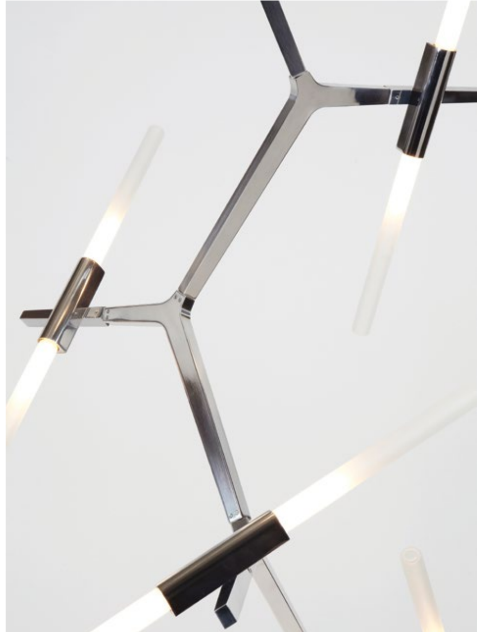
AGNES Cascade – 20 Lights Polished Nickel / Straight-Cut Glass