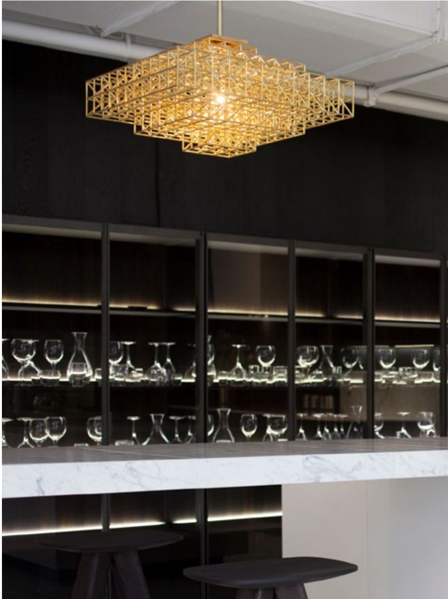
GRIDLOCK Pendant – 1912 Raw Brass