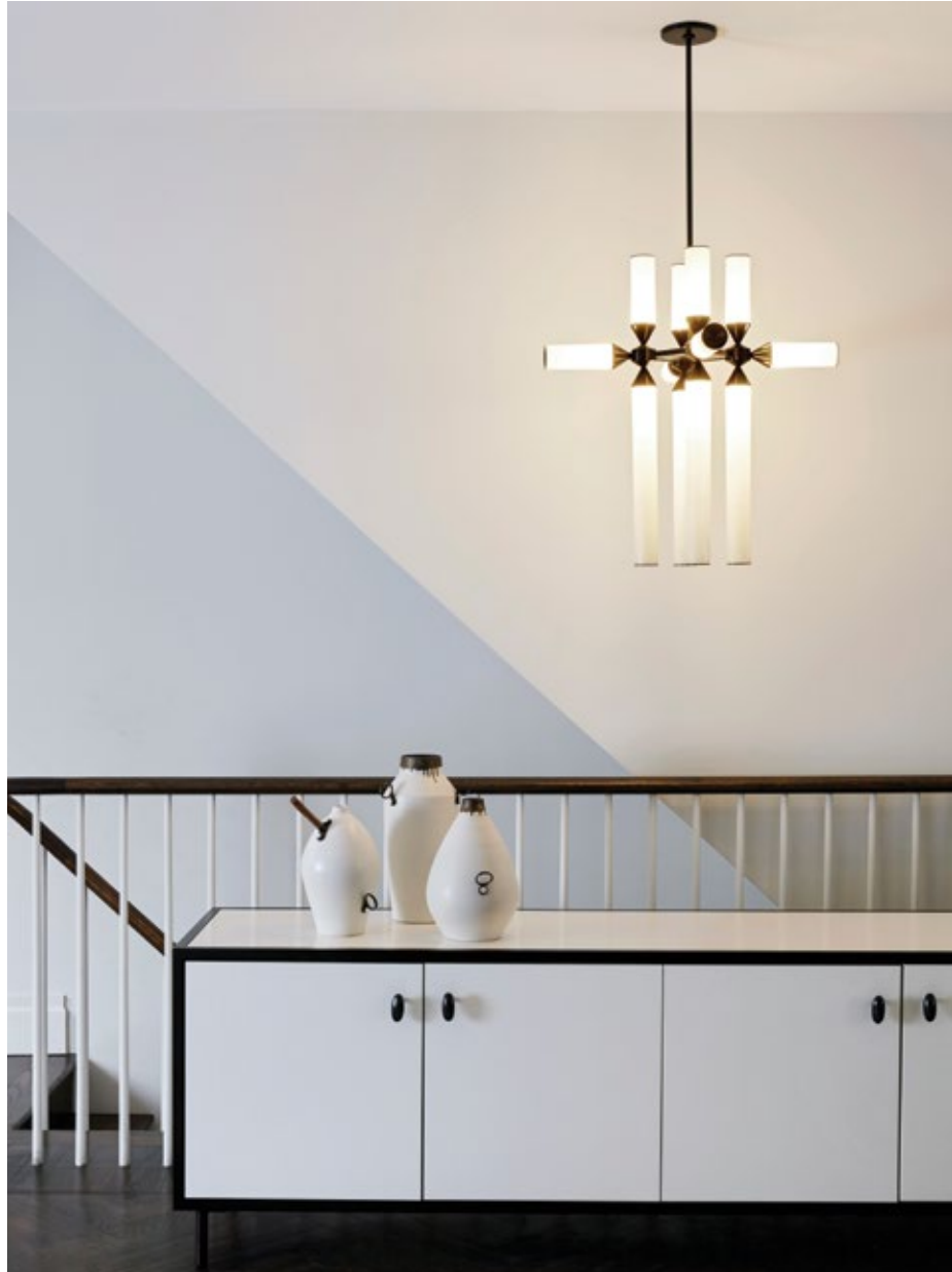
CASTLE 12-02 Black / Cream